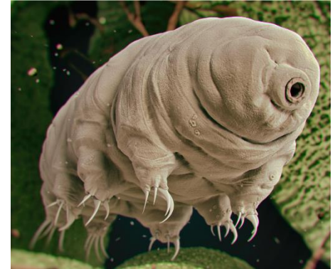
Figure 1: tardigrade

recent research by Anoud et al. (2024) reveals that tardigrades still accumulate DNA damage but survive by activating powerful DNA repair mechanisms. The study identified a unique tardigrade gene encoding the protein TDR1, which binds to DNA and forms aggregates, likely helping repair fragmented DNA [12].